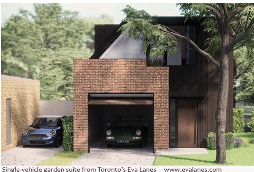
Single-vehicle garden suite from Toronto's Eva Lanes www.evalanes.com

The new building is a mostly-autonomous auxiliary dwelling unit, normally up to 6.0m (19.68 feet) tall, that cannot be legally severed from the main property, but is permitted a wide variety of uses, including as a revenue-producing (rental) unit. Where practical, some will have optional indoor vehicle parking.