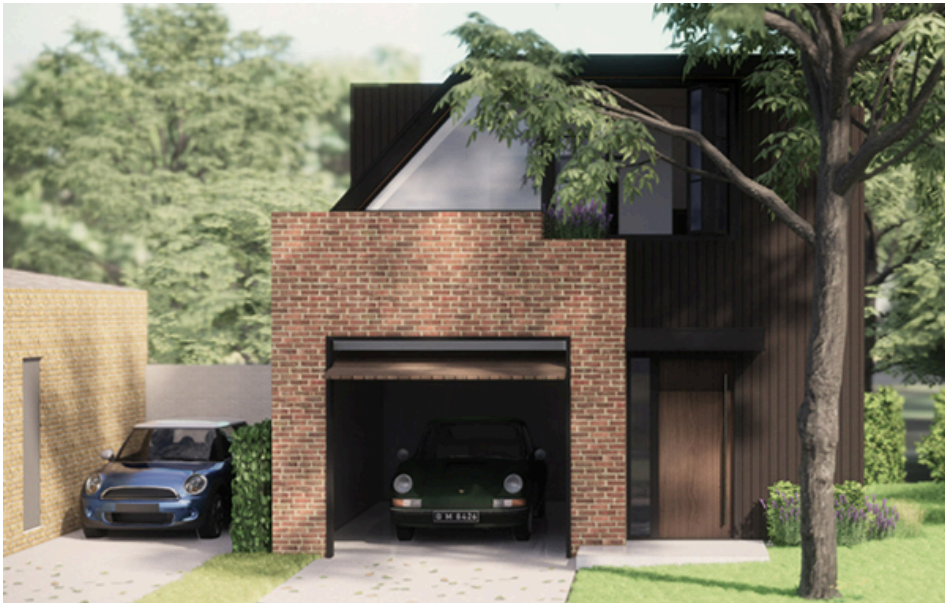
Single-vehicle laneway house from Toronto's Eva Lanes - www.evalanes.com

The “buildable area” (grey in the diagram above) at 155 Rhodes Avenue grants a very limited variety of placement options and footprint designs, if the build size is maximized. There are no prescribed minimum or maximum width or depth measurements, provided the footprint falls within the buildable area as outlined in grey above, all construction meets the provincial building code, and the footprint does not exceed 645.8 square feet. Walls with windows or doors must be placed at least 4.9 feet away from the respective property lines.